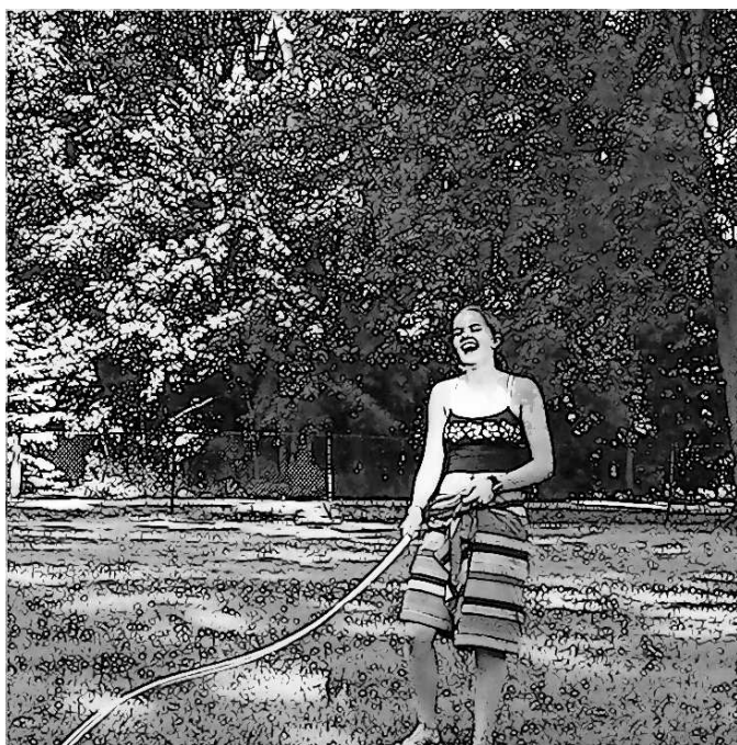
2005 Portage Lake National Regatta Fun

Sunday July 12, 2009 Registration, Weighing & Measuring 10am-12pm, 1pm - 4pm Board mtg. 10:30 am (Juniors: Competitor's Mtg. 12pm Races 1-3 start at 1: 15pm) Welcoming Party Hors d'ourves (cash-bar) 6:30pm Monday July 13, 2009 Registration, Weighing & Measuring 9am-11:00pm Juniors: Races 4-6 start at 9:30pm Lunch 1:30 (pay as you go) Seniors: Competitor's Mtg. 12pm Races 1-2 start at 1:30pm Tuesday July 14, 2009 Race 3 @ 10am Lunch 12pm (pay as you go) Race 4-5 @ 1:30pm General Membership Mtg. & BBQ Wednesday July 15, 2009 Race 6 @ 10am Lunch 12pm (pay as you go) Race 7-8 @ 1:30pm Junior's Night Out, /Seniors on your own Thursday July 16, 2009 Race 9 @ 10am No race will start after 1pm Evening: Awards Banquet